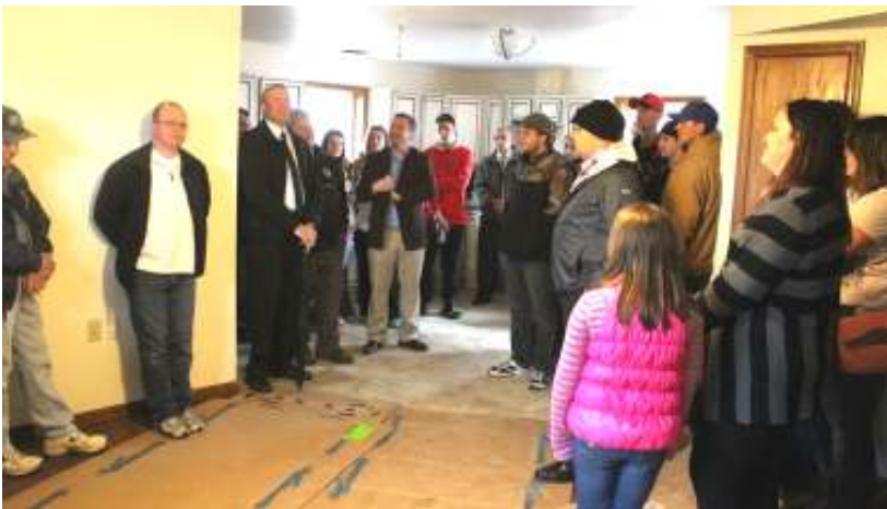
Hibbing and Chisholm High School students and students from Hibbing Community College's electrical class receive NSLCHFH's "Champions of Affordable Housing" award at the Tupa's Home dedication in May 2014.

Families in North St. Louis County have benefited from the Applied Learning Initiative as students from Chisholm and Hibbing High Schools and the Hibbing and Mesabi Community Colleges have partnered with Habitat for Humanity to build homes. This great partnership with the Applied Learning Institute and area schools, dating back to 2008, has helped 13 families into their homes in Hibbing, Virginia and Mt. Iron.