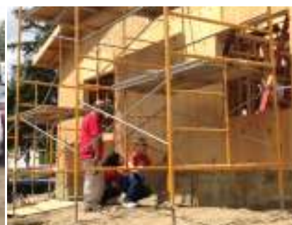
Target team hard at work on Rayton home in Virginia