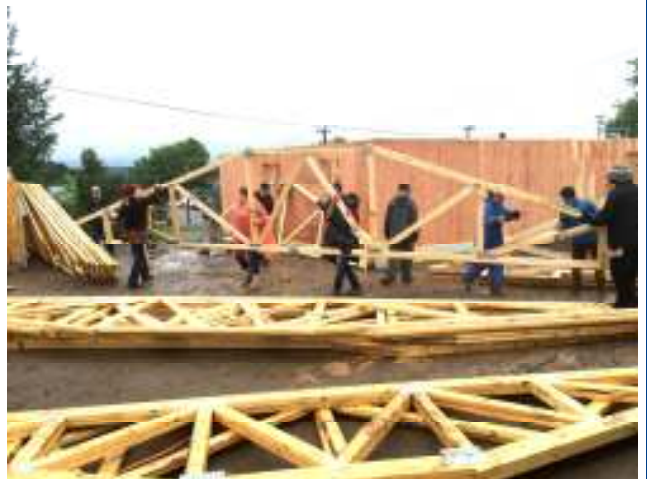
Photo: Volunteers work together to lift the trusses onto the Anderson-Carlness home in Ely.